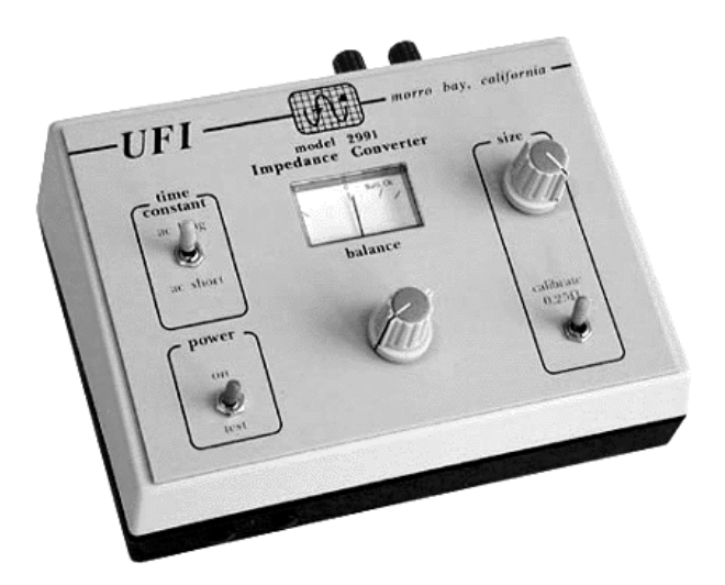
UFI 545 Main Street, Suite C-2 Morro Bay, CA 93442